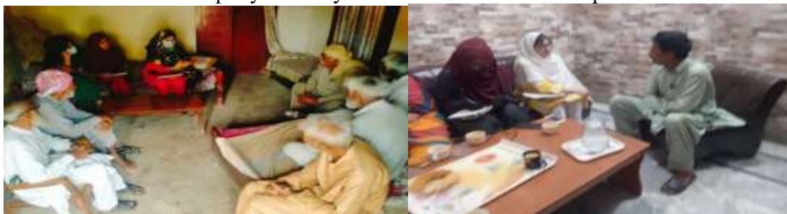
Fig 1.1 focus group discussion on left and key informant interviews on right

was lasted between 45 to 60 minutes. Purposive sampling technique was used to select focus group participant. We asked native peoples in local language Punjabi, because it was more convenient for locals to understand the query and they can feel comfortable to response.