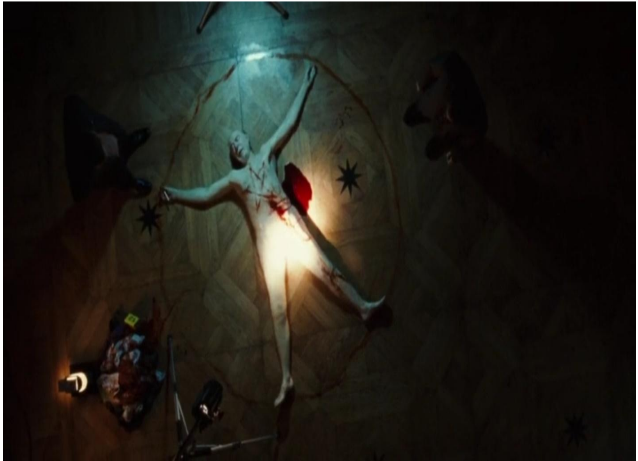
Figure 4.1, Datum 1