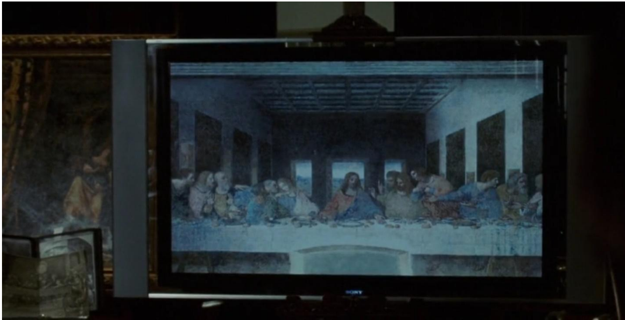
Figure 4.4, Datum 4