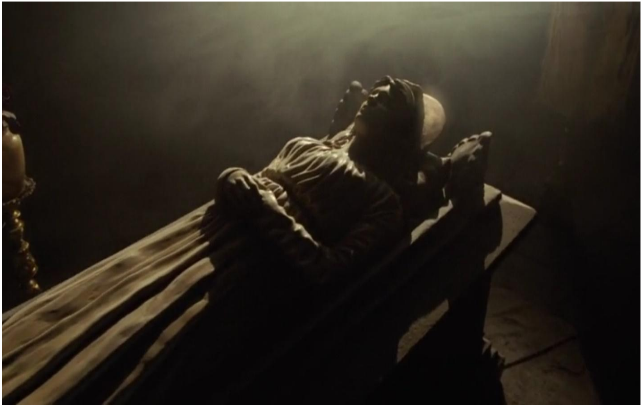
Figure 4.3, Datum 3