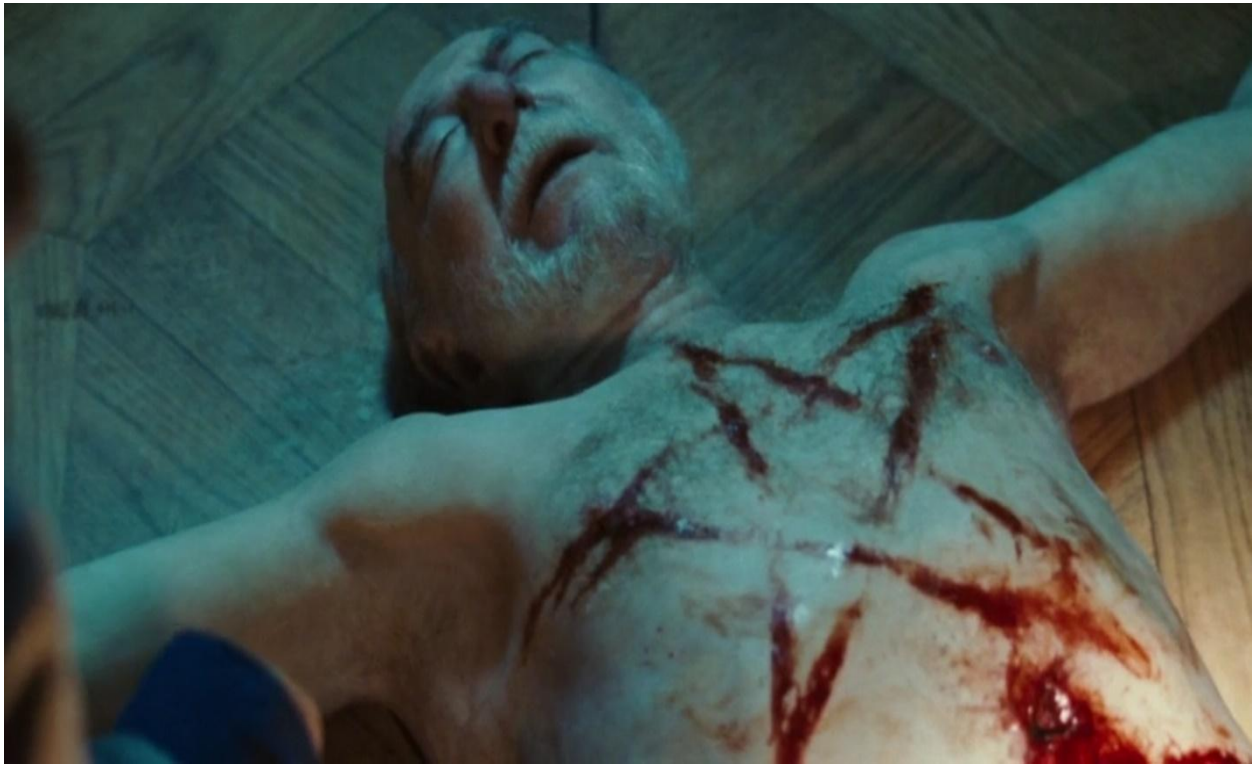
Figure 4.2, Datum 2