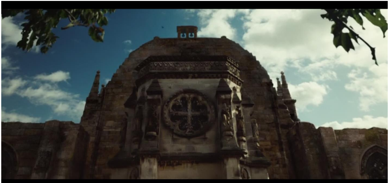
Figure 4.6, Datum 6