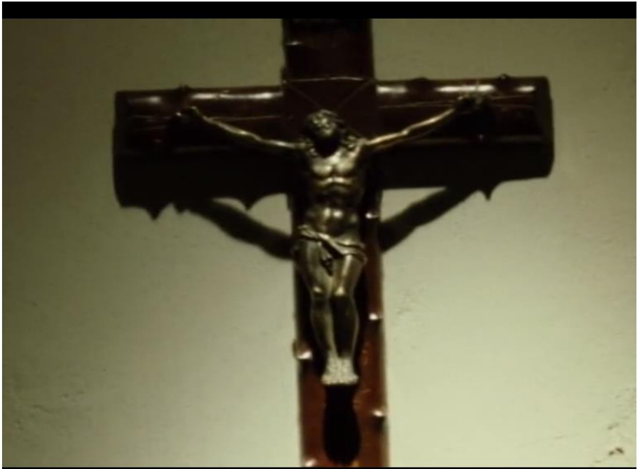
Figure 4.5, Datum 5